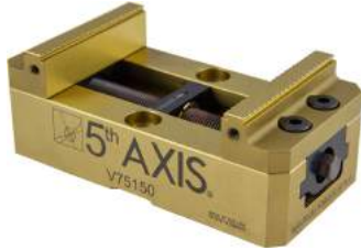
Self-Centering 75mm x 150mm

Size: 75 x 150 x 56mm HT Description: 75mm x 150mm Self-Centering vise. PN: V75150