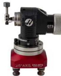
Renishaw OTS 52mm Adapter

Description: 52mm RockLock quick change adapter built for Renishaw OTS tool setter. PN: R52-HTS