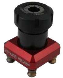
ER40 Fixture 52mm Adapter

Description: 52mm RockLock quick change adapter for CER40 roundbar fixture. PN: R52-CER40