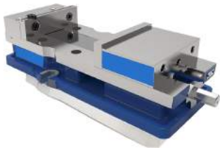
Crossover + D688 RockLock 96mm Adapter

Description: 96mm RockLock quick change adapter plate for DX6 CrossOver vise and D688. Crossover PN: RL96-KDX6 D688 PN: RL96-KD688