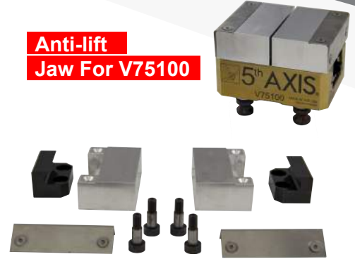
Anti-lift Jaw For V75100

Description: Anti-lift aluminum machinable jaw set for V75100 vise. PN: AL75A