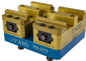
Lil' Deuce and V75150 RockLock 96mm Adapter

Description: 96mm RockLock quick change adapter plate for 2X Lil' Deuce or 2X V75150 vises. PN: R96-2V75